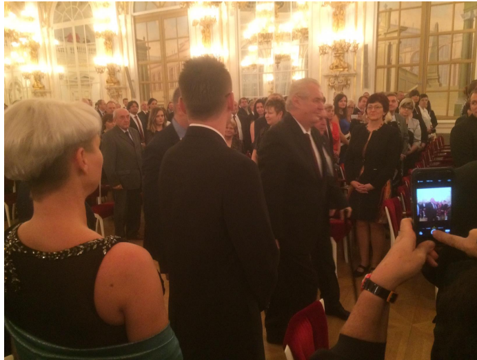
President Milos Zeman arrives