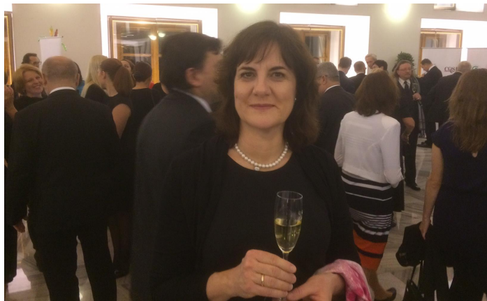
Yours truly enjoys a glass of champagne